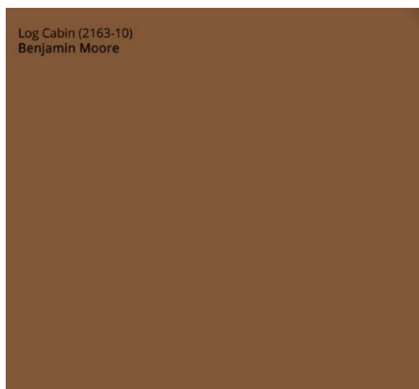
Log Cabin (2163-10)