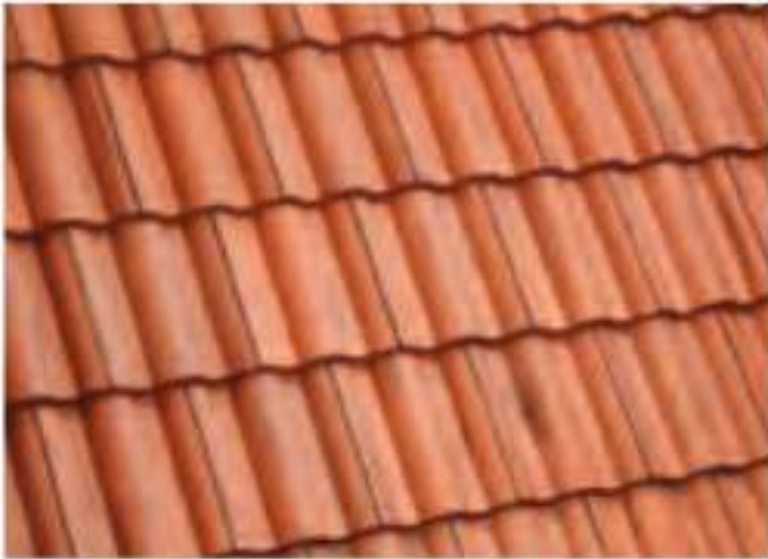
29501 Maple Forge Red Orange, Maroon Streaks