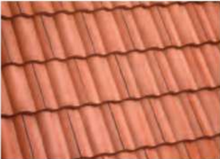
2664 Terracambra Range Terracotta Range